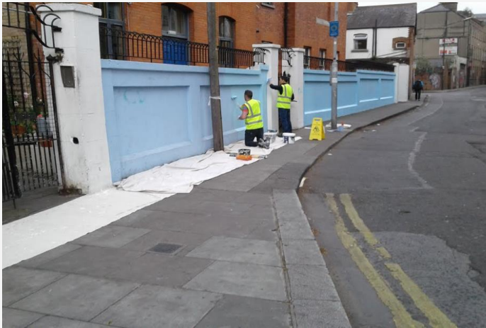
Pictured above: Work being completed on The Back Lane Hostel

The Mobile Community Service Unit began in May 2017 and since has been involved in a number of projects, including: