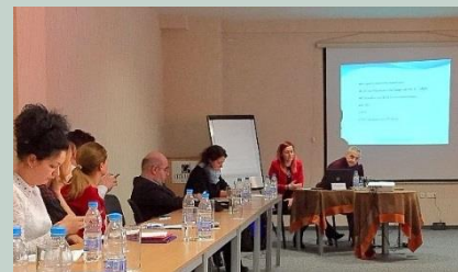
Pictured above: Some of the participants at the RASMORAD workshop in Sofia, Bulgaria