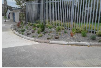
Pictured above: A flower bed in Swords, before and after.

The one big positive I find is the amount of pedestrians that thank the clients for the clean up work that they do really pays dividend for the clients.