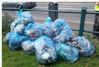
Pictured above: Sean Moore Park